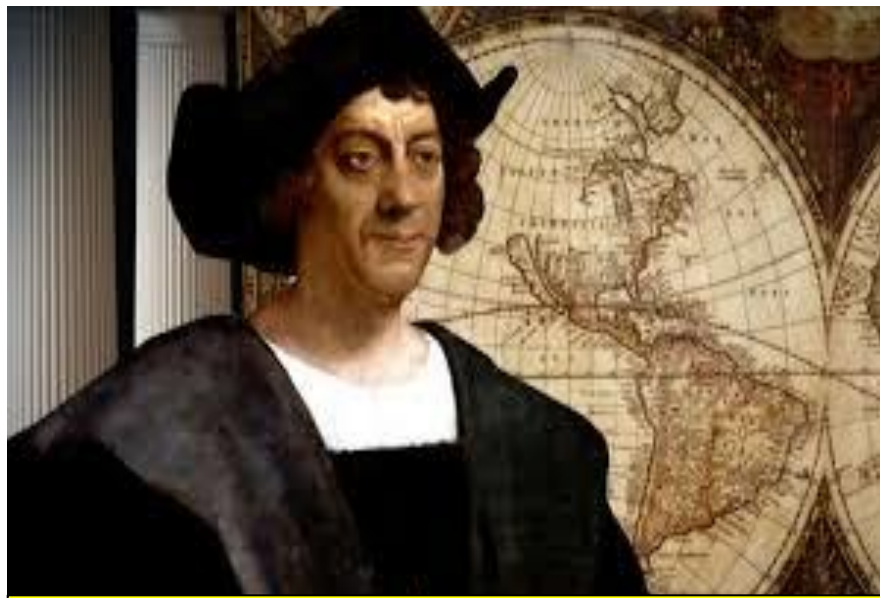
Christopher Columbus (sailor)