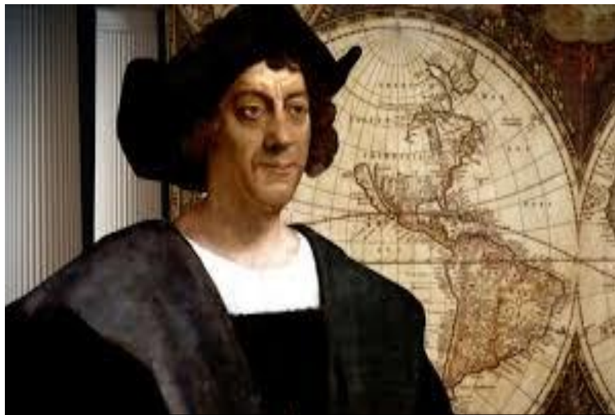
Christopher Columbus (sailor)