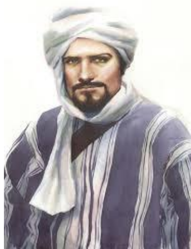
Ibn Battuta (explorer)

Famous for - Journeying to the Middle East, North Africa, India and China over 700 years ago. He travelled over 72,000 miles before planes were invented!