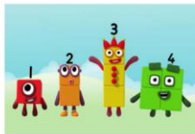
Numberblocks at home

Materials to support Early Years and Year 1 teachers