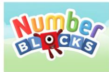
Numberblocks Support Materials

Materials to support Early Years and Year 1 teachers